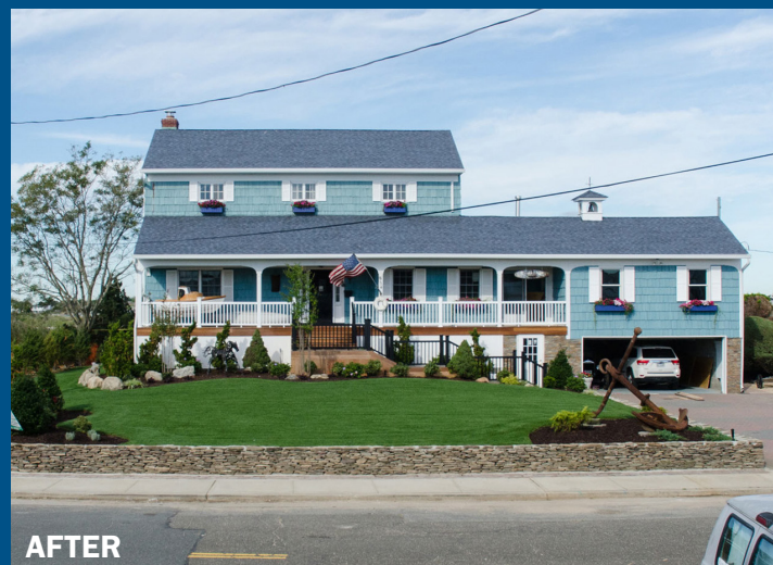
Project example House Elevation – Freeport, New York